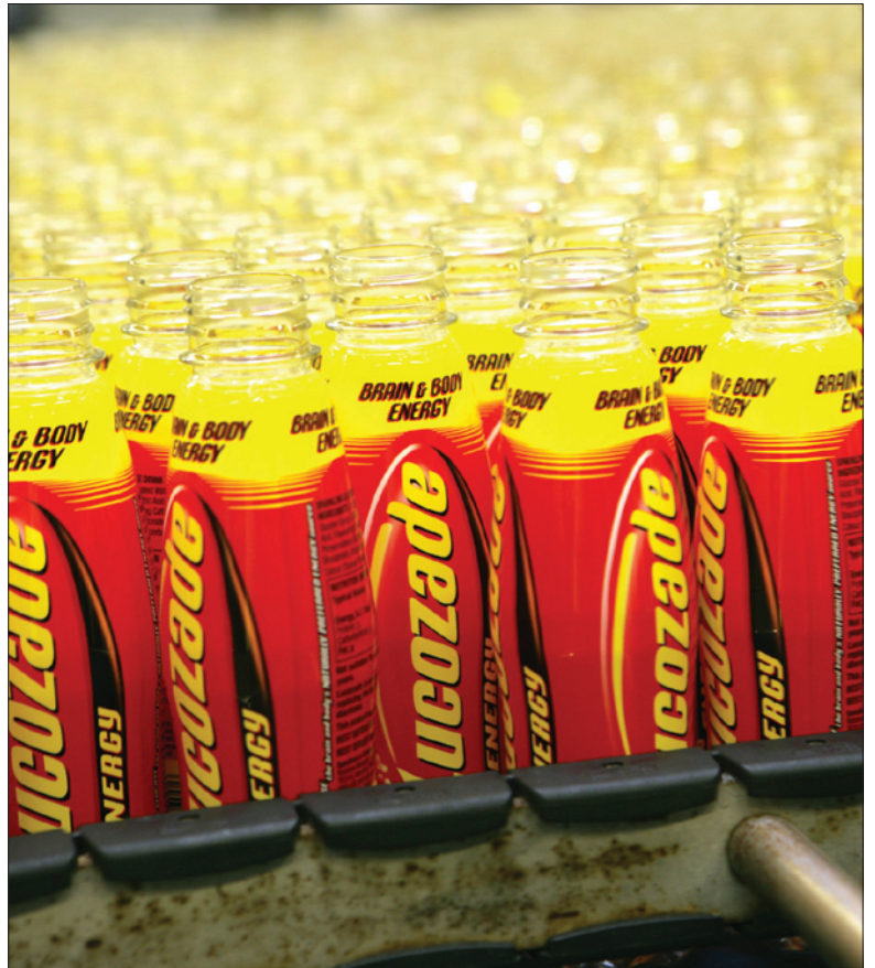
GSK: PUTTING THE FIZZ INTO REGIONAL BRANDS

GlaxoSmithKline (GSK) Consumer Healthcare is a fascinating case in point. To ensure that its